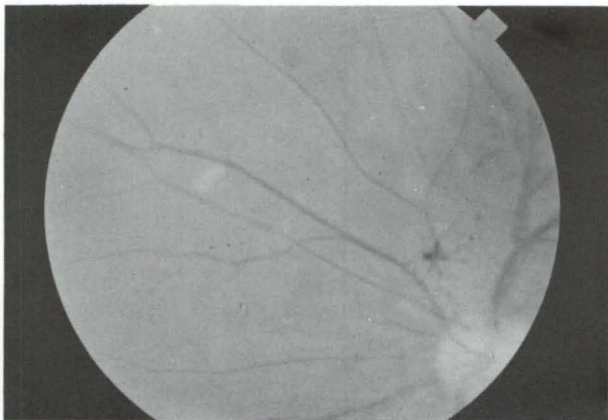
Figure 1. Fundus characteristic of CMV retinitis revealed intraretinal hemorrhage, retinal edema, necrosis and exudate. (right eye).

ulcers. He had a history of tuberculous lymphadenitis and anemia one year previously and received four units of blood transfusions. He continued taking anti-TB drugs until admission. There was no history of homosexuality nor intravenous drug abuse; however, he was Anti HIV-positive. Clinical diagnosis of pneumocystis carinii pneumonia and oral candidiasis was considered. After receiving a regimen of cotrimoxazole and nystatin for 1.5 months, his condition was improved and he was discharged from the hospital. One month later, he developed a herpes simplex perianal ulcer and was treated with oral acyclovir for one month. Two months later, the patient presented with fungal septicemia and blurred vision of the right eye. Fundoscopic examination of the right eye revealed multiple intraretinal hemorrhages, retinal edema, an area of retinal necrosis exudate, and sheathing of retinal blood vessels (Figure 1). These fundus pictures were compatible with CMV retinitis. Multiple "cotton wool" spots were found in the left eyes. Two months later, characteristic CMV retinitis developed in the left eye. (Figure 2) The patient died four months later.